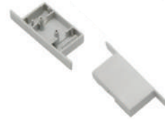
Plastic End Caps for Up Down Aluminum Channel SKU: AE-040L-CAP