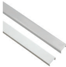
PC Cover for Up Down Aluminum Channel (Clear or Frosted) SKU: AE-040L-CVR-CLR-2M AE-040L-CVR-CLR-2M