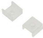
Plastic End Caps for Up Down Aluminum Channel SKU: AE-040L(PC)-MNT