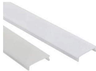
Double Wide Shallow Channel Cover (Clear or Frosted) SKU: AE-2310-CVR-FRS-1M AE-2310-CVR-FRS-2M AE-2310-CVR-CLR-2M