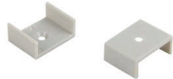
Double Wide Shallow Channel Bracket (Plastic) SKU: AE-2310(PC)-MNT