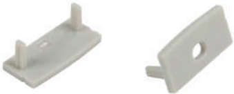
Double Wide Shallow Channel End Cap SKU: AE-2310-CAP