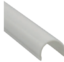
Cover SKU: AE-2623-CVR-FRS-2M(Round)