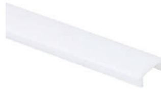
Wide Deep Channel Cover SKU: AE-1715-CVR-FRS-1M AE-1715-CVR-BK-2M