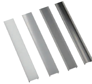
Universal Channel Covers SKUs: