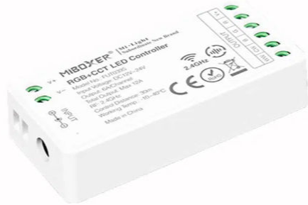
RGB+CCT Strip Light Smart Controller – G3 ( sold separately ) SKU: MILI-CONT-G3-RGBCCT-STP