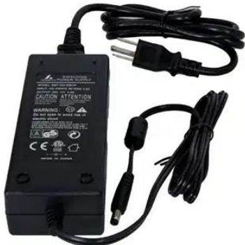
Indoor Plug-in LED Driver Dimming ( sold separately ) SKU: PWR-PLG-24V-96W-ID-G2