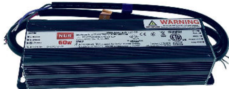
Outdoor LED Driver 0-10v Dimming ( sold separately ) SKU: PWR-010V-60W-24V-OD