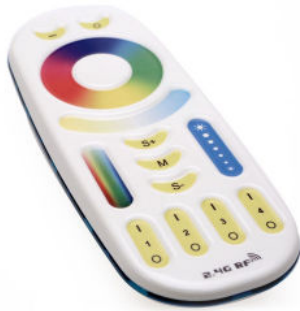
RGB+CCT 4 Zone Remote ( sold separately ) SKU: MILI-REM-RGBWW-WALL-4Z